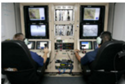
Unmanned Aerial Vehicle

In April 2010, The New York Times reported that UAVs launched at least 50 attacks in Pakistan last year resulting in at least 500 casualties. The UAV is emerging as the signature technology of the new crisis of visibility, even touted as environmentally friendly (relative to ground operations). On the one hand, it epitomizes what Derek Gregory has called the “visual economy” of the “American military imaginary” (2010: 68). At the same time, it is clearly a departure from conceiving counterinsurgency as “armed social work” (75). The operators of such attacks are not even in the same country as their targets, but instead work from trailers in Utah or Nevada via digital interface. Furthermore, the current results in Afghanistan and Pakistan are unclear even by counterinsurgency standards. In asymmetric warfare, how does one measure success? Recent military discussion, both official and unofficial, has raised this question in connection with the transformation of military life from a field-based set of activities into a permanently digital mission, not unlike the professional activities of a sales executive. In the eighteenth century, the newly invented lowest rank of officer, known (interestingly enough) as the subaltern, reported back to the general in person on the state of battle, thereby embodying visibility.