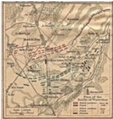
Waterloo Battle Map

This dizzying, mutually reinforcing set of scenarios is what globalization looks like. It is what Achille Mbembe has called the “entanglement” (2001: 14–16) typical of this period in which nations have been decolonized and yet are subject to neo-colonial control, while the former colonizers have come to grasp that the global empire described by Hardt and Negri has authority over them rather than vice-versa. In order to find our way through the entanglement we need to start at a specific point: as visualization was originally a military tactic, let’s begin with counterinsurgency. For the conservative historian Thomas Carlyle, writing in 1840 just after the aftermath of the emancipation of the enslaved in the British Empire, visibility was the attribute of the hero (Mirzoeff 2006). Carlyle appropriated the idea by which a general was held to visualize a battlefield that had become too large to be seen by any one person.